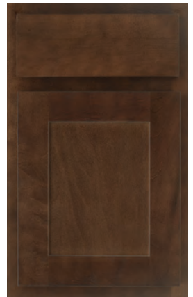
Also available in slab drawer front