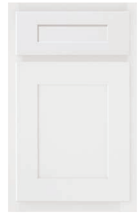
Also available in 5-PC drawer front